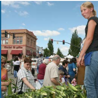
Expanded farmers' markets