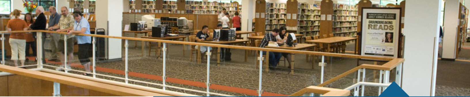
Expanded and renovated Main Library