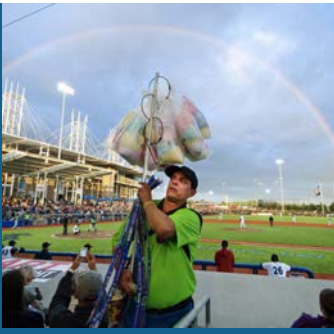
Hillsboro Hops at the Hillsboro Ballpark