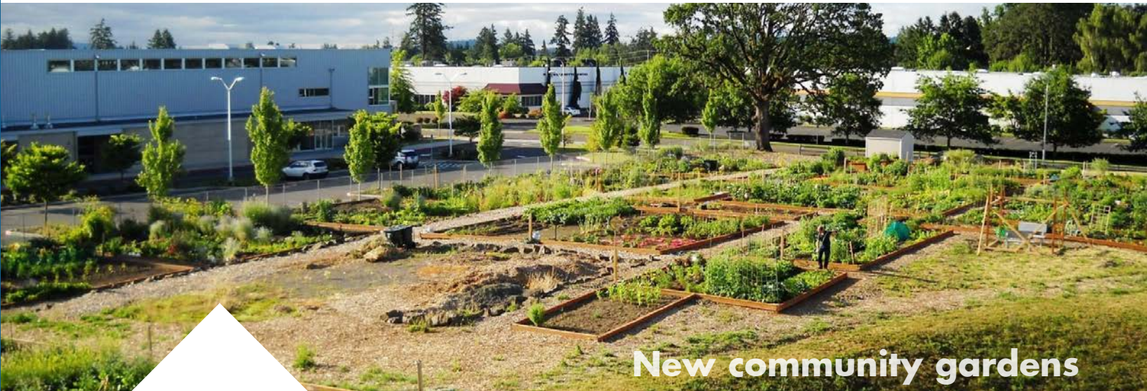
New community gardens