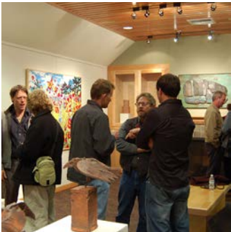
Walters Cultural Arts Center