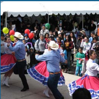
Hillsboro Latino Festival