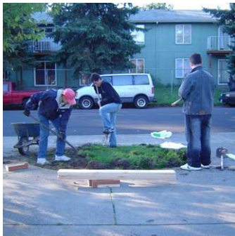
SOLVE volunteer community clean-up days