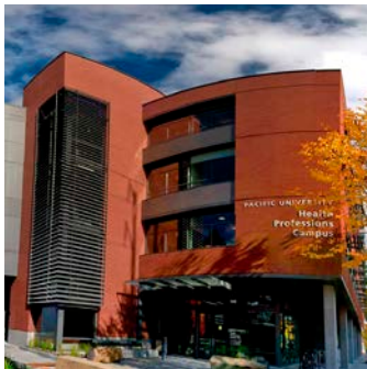
Growing economic investment and diversification