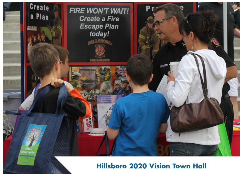
Hillsboro 2020 Vision Town Hall