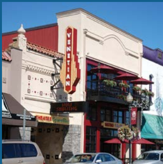
New investment in redeveloping downtown