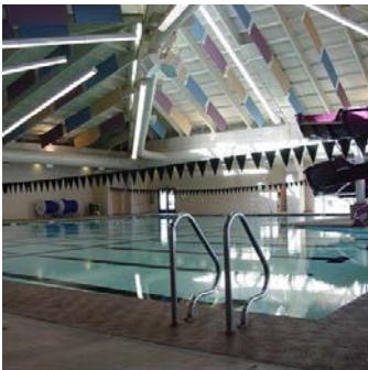
Shute Park Aquatic and Recreation Center