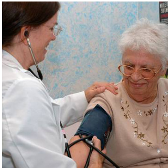
Expanded health care access and services