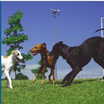
Hondo off-leash dog park