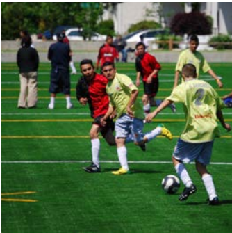
New community gathering places

How much does visioning really impact a community? In Hillsboro, the answer is a lot and the evidence is everywhere. These photos capture just a few of the many visible outcomes that resulted from the original visioning effort. Most of the 180 community priorities incorporated into the Hillsboro 2020 Vision and Action Plan since 2000 are now implemented. Whether one-time special projects or ongoing programs, each of these actions has helped to advance Hillsboro toward our shared community Vision.