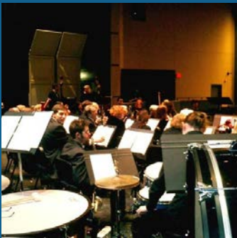
Expanded musical and theatrical performances