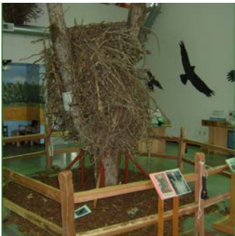
Jackson Bottom Wetlands Preserve enhancements