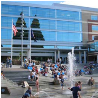
Hillsboro Civic Center and Tom Hughes Civic Center Plaza