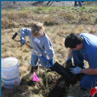
Native tree planting in critical habitat areas